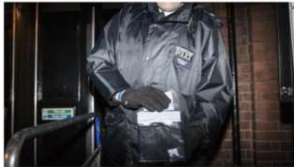
A Met Police officer holding a bag of confiscated drugs.

This article is part of "Safe Sesh", a VICE harm reduction campaign produced in collaboration with The Loop and the Royal Society for Public Health. Read more from the editorial series here .